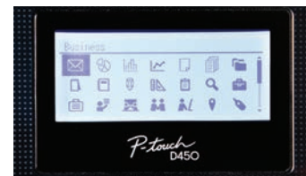
14 fonts : 99 frames Over 600 symbols