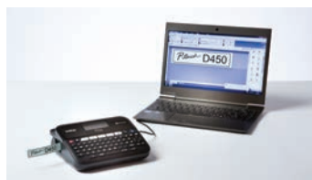
Print labels from your PC or Mac

This high specification labeller is the ideal partner in your office to help you and your colleagues stay organised, though the clear identification of important items using durable P-touch labels.