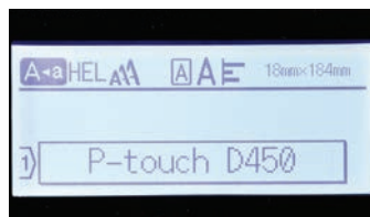
Graphic display with print preview